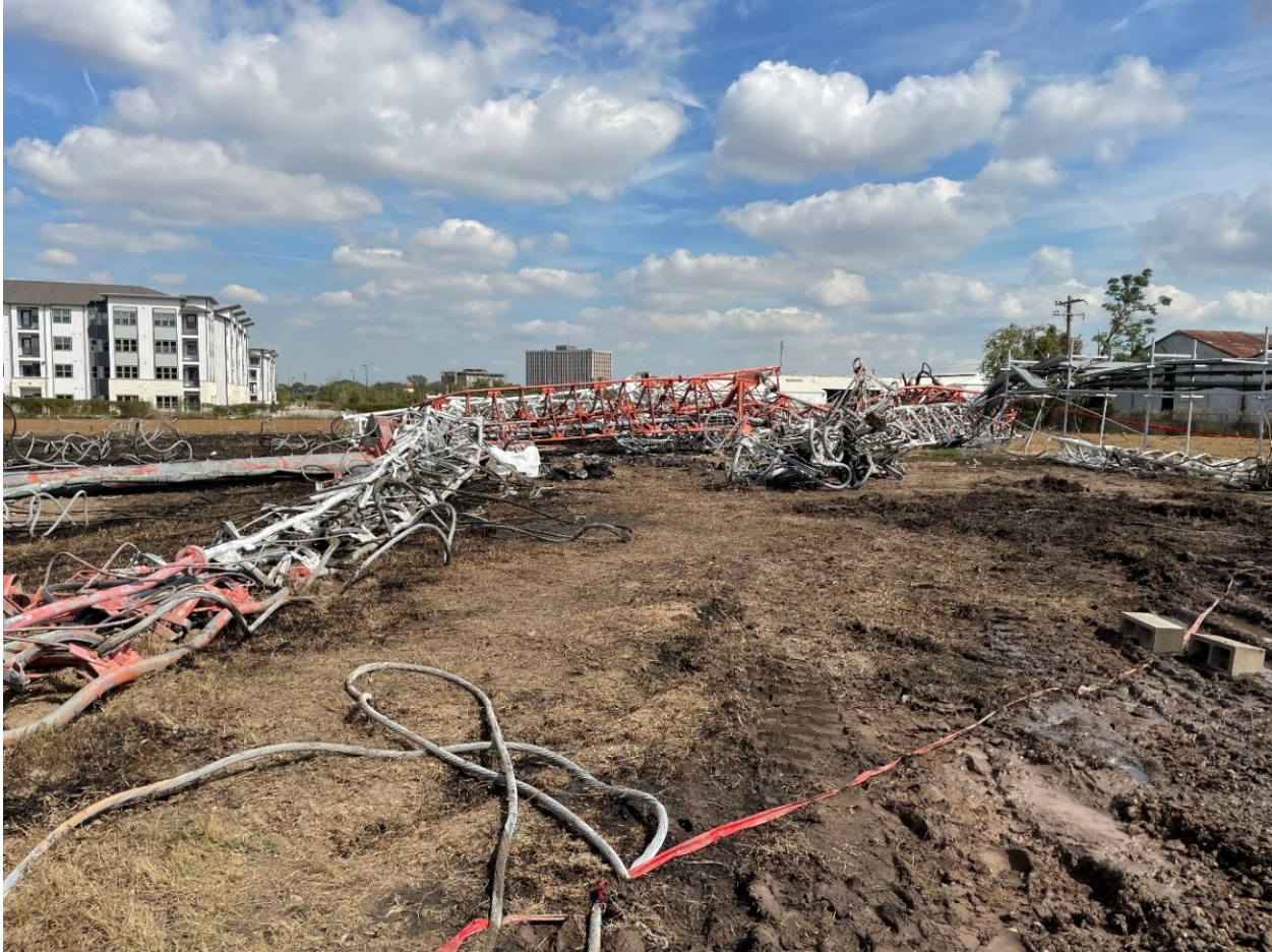
Figure 3. Accident site with collapsed radio tower.

The debris field measured about \frac{1}{4} mile northwest of the radio tower and contained fragmented sections of plexiglass, main rotor blades, console components, upholstery, flight controls, and landing gear. Portions of the forward fuselage structure were found embedded in the radio tower structure about 100 ft from the top, consistent with the video and witness information.